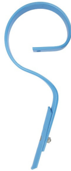
Fig. 6. Straight chisel point on gamma-shaped spring tine

After full maturing, the broken flax is collected by round balers [24;25], which form dense bales and wrap them with a net (Fig. 7). The use of a net for wrapping allows get maximum productivity of this technological operation, ensures safe storage of the broken flax in the bales in open air, and greatly facilitates the unwinding of bales at flax primary processing enterprises.