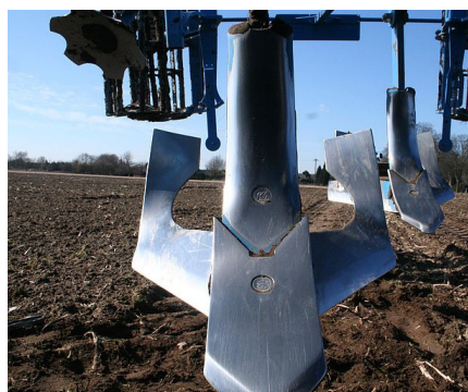
Fig. 2. TriMix paws on stubble cultivator for maximum residues burying

rollers [19]. Rollers provide leveling of the field surface and consolidation of the top layer. The use of such tillage machine allows eliminate the compaction, created by arable aggregates and wheel systems of tractors and farm machinery, leveling the field surface to ensure maximum productivity of subsequent technological operations, and also protect the upper layer of soil from water and wind erosion [20].