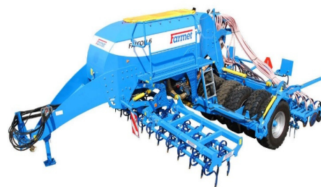
Fig. 5. Combined seeding aggregate for flax

To create the most favorable conditions for germination of flax seeds [23] and the subsequent development of their root system, the tillage module of this combined aggregate must be equipped with a straight loosening point on the spring gamma-shaped tine (Fig. 6). Such shape of tines helps produce intensive tillage at a depth of 2-10 cm in early spring without extracting of wet soil elements from the lower layers to the soil surface. The spring tines provide a high crumbling intensity of the treated layer, and its narrow chisel point minimizes the soil compaction zone below the treatment depth.