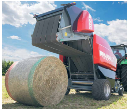
Fig. 7. Balers picking broken flax with netting

After the bales are collected and removed from the field, the broadcast dressing of perennial grasses is done with mineral fertilizers by spreaders. Further technological operations for the care of perennial grasses and their harvesting are carried out according to the technologies of forage harvesting adopted for local farms.