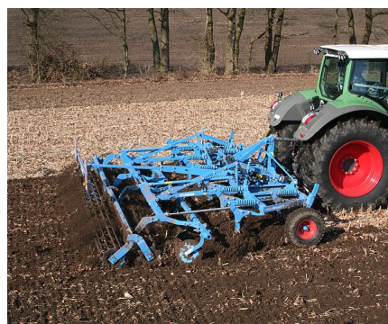
Fig. 3. Stubble cultivator with TriMix paws in work position

To ensure the required plant nutrition regime, the proposed technology provides for the use of wide-spreading mounted or trailed spreaders of mineral fertilizers capable of ensuring a high uniformity of fertilizer distribution at the level of 93-95 %. An increase in the working width of fertilizer spreaders reduces the number of passes of heavy aggregates. On the trails after the tractor and spreader's wheel passes a decrease is observed in the yield and quality of flax due to its sensitivity to soil compaction.