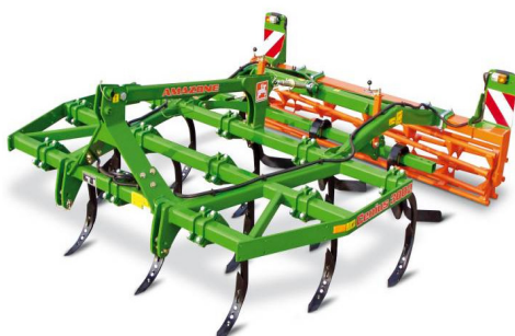
Fig. 4. Tillage cultivator for deep soil preparation

In order to maximize the preservation of soil moisture and provide the most favorable conditions for germination of flax seeds and seeds of perennial grass, the proposed technology provides for sowing flax with a combined sowing aggregate (Fig. 5), combining soil preparation, consolidation of the treated layer and sowing [21;22].